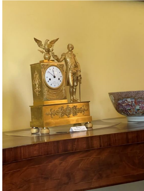
George Washington clock at the Hammond-Harwood House.