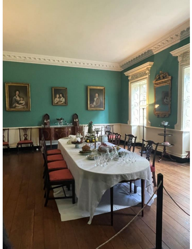
My favorite room, the Dining Room, at the Hammond-Harwood House.